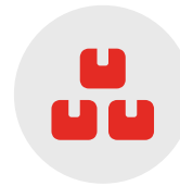
PART TRUCK LOAD (PTL)