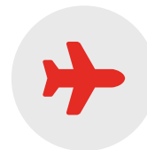
CARGO & COURIER