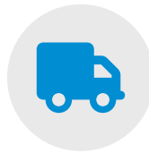
FULL TRUCK LOAD (FTL)