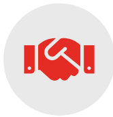
THIRD PARTY LOGISTICS

LogisticsERP is developed specifically to support a wide range of transport and logistics operations. The system is structured to handle diverse consignment types, routing models, billing requirements, and reporting needs commonly used across the logistics industry. Its flexible masters, transaction workflows, and reporting modules allow businesses to manage daily operations efficiently while maintaining accuracy and compliance.